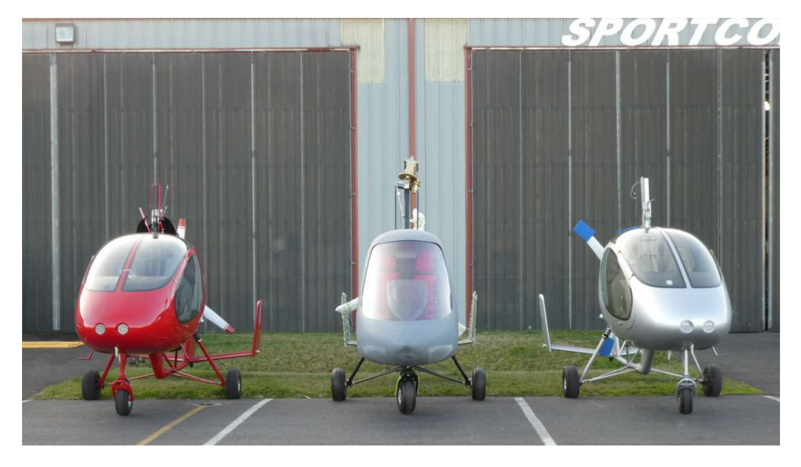
Between two "big brother" SC2s, you can see how substantial the M2 is.